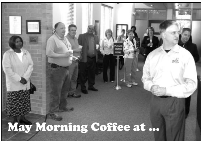
May Morning Coffee at ...