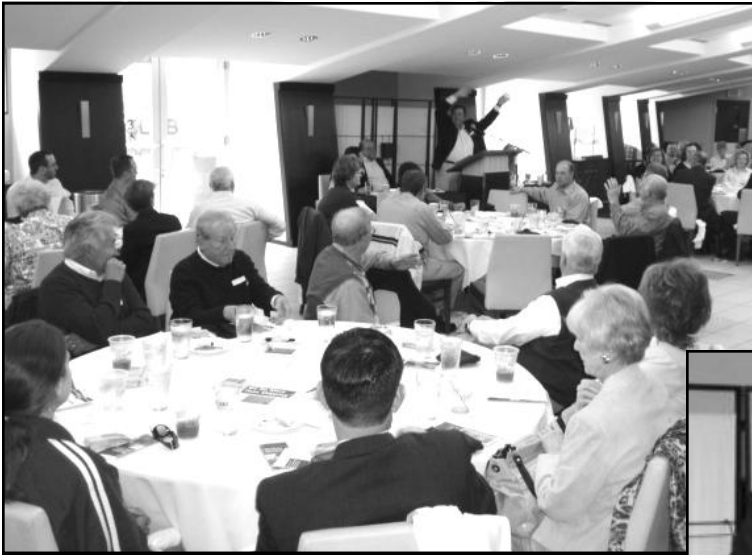
Royals Luncheon at the Crown Club