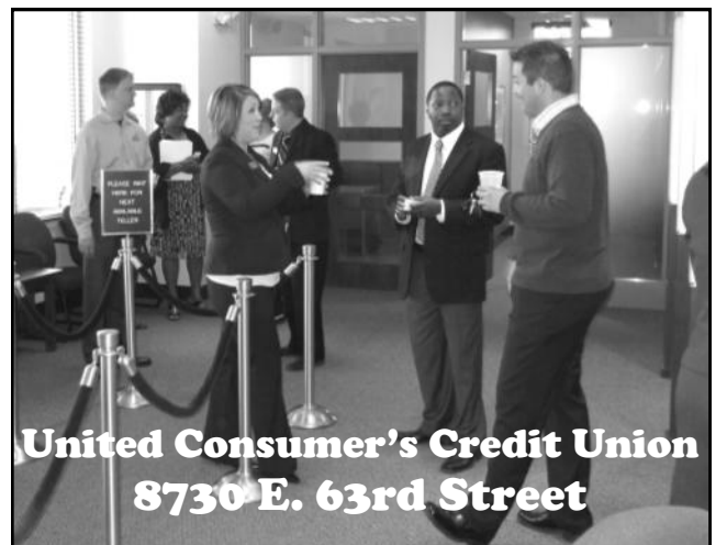
United Consumer's Credit Union 8730 E. 63rd Street