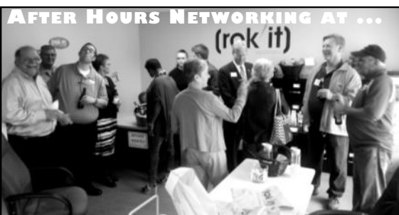
AFTER HOURS NETWORKING AT ... (rock it)