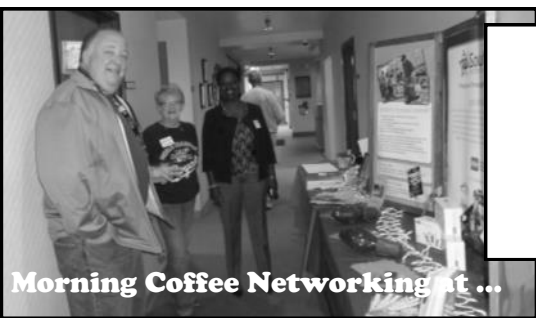
Morning Coffee Networking at ...