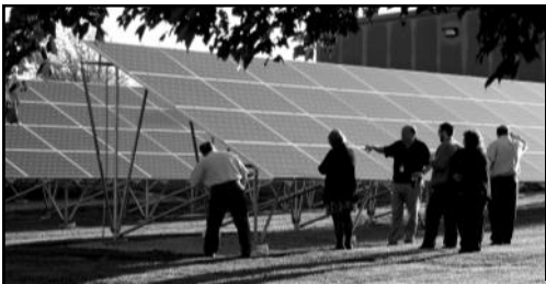
Morning Coffee Networking at ...

OUR BUSINESS IS A CHAMBER MEMBER BECAUSE: We like to give back to the community & network with other business minded companies.