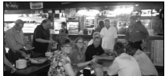
AFTER HOURS NETWORKING AT ...