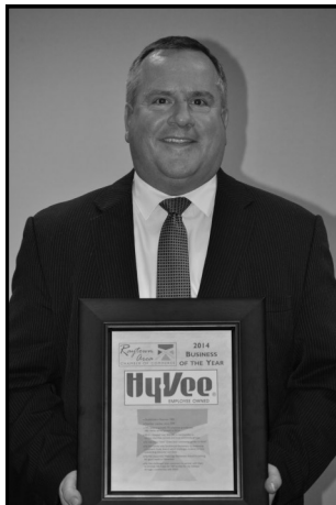
BUSINESS OF THE YEAR Hy-Vee #1542