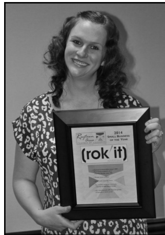
SMALL BUSINESS OF THE YEAR rok'it Advertising