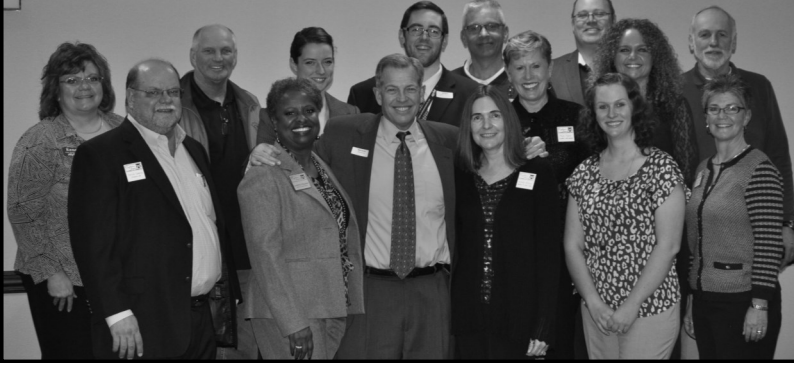
RAYTOWN CHAMBER BOARD OF DIRECTORS

☺ We would like to thank our members who gave 110%.