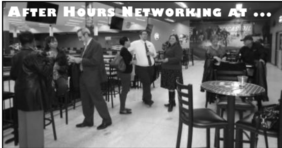
AFTER HOURS NETWORKING AT ...

EXTREME GRAND PRIX 6731 BLUE RIDGE BLVD.