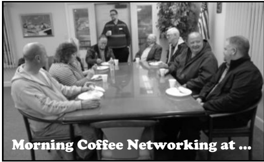
Morning Coffee Networking at ...