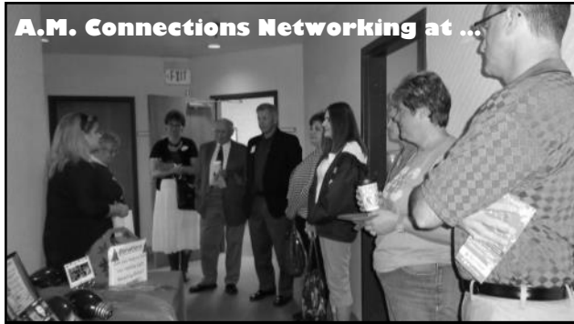
A.M. Connections Networking at ...