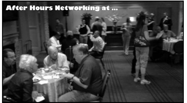
After Hours Networking at ...

Adam's Mark Hotel & Conference Center ▶▶▶