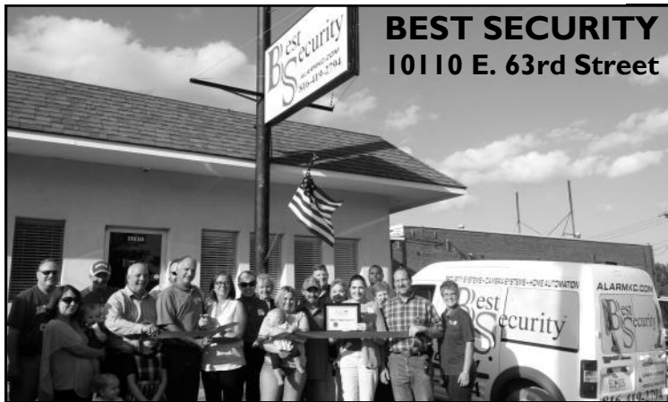
BEST SECURITY 10110 E. 63rd Street