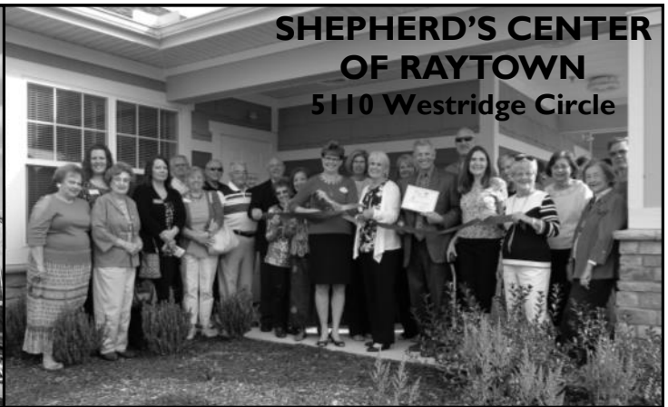
SHEPHERD'S CENTER OF RAYTOWN 5110 Westridge Circle