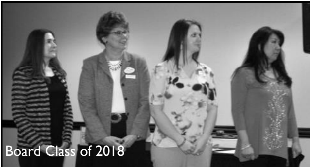
Board Class of 2018

We would like to extend our sincere appreciation to the following: