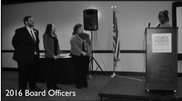
2016 Board Officers