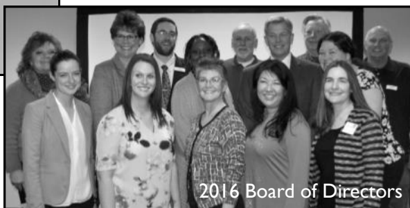
2016 Board of Directors