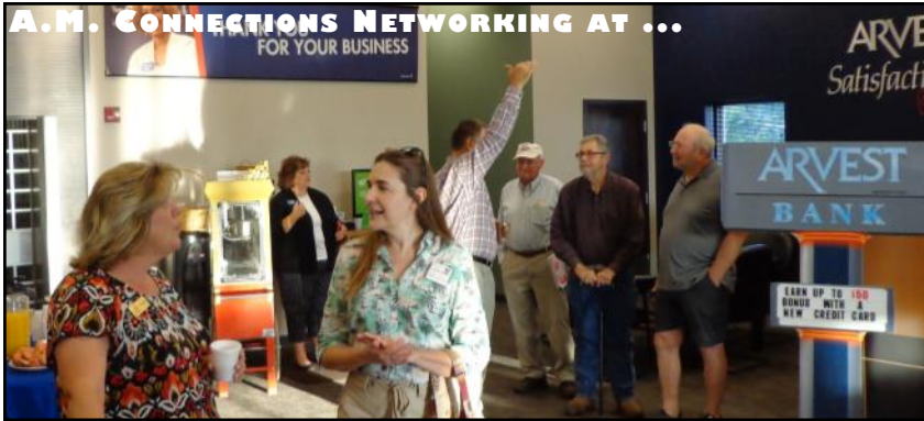
A.M. CONNECTIONS NETWORKING AT ...