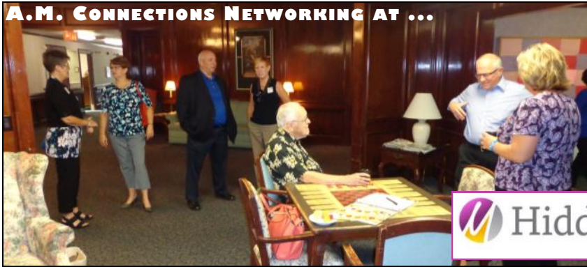
A.M. CONNECTIONS NETWORKING AT ...