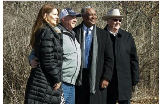
ROCK ISLAND GROUND BREAKING - PHASE I - HARTMAN PARK, LEE'S SUMMIT, MO