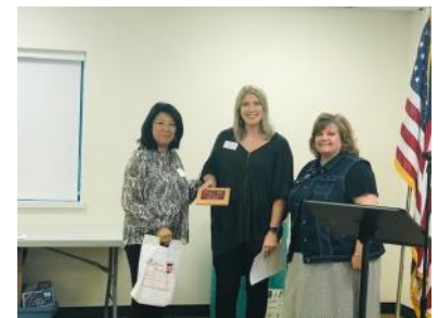
New Member Partners in Primary Care received their plaque. Welcome!