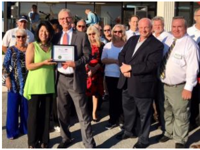
September 20th - Ribbon Cutting & Celebration