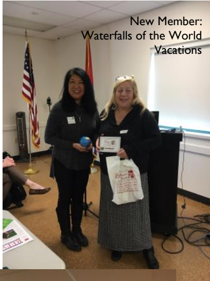
New Member: Waterfalls of the World Vacations