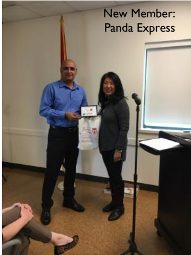
New Member: Panda Express