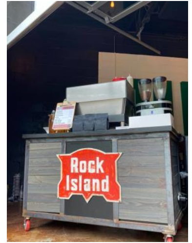
A.M. Connections held at new member, Rock Island Coffee KC located inside Crane Brewing on Friday, September 24. ; open Friday through Sunday 7:00 a.m. to 2:00 p.m.