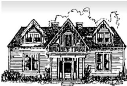
Friends of Rice-Tremonti 1844