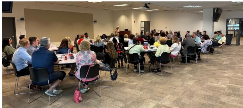
Attended the Scholarship reception hosted by Raytown Educational Foundation