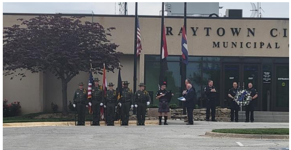
Attended the Police & Wreath Laying ceremony to remember all fallen officers during National Police Week at Raytown City Hall.