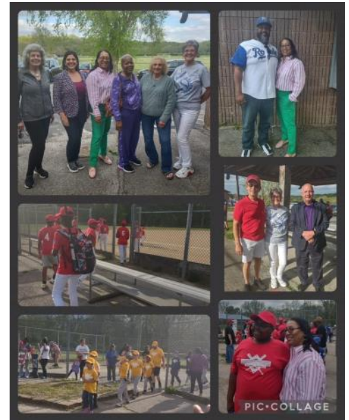
Local leaders attending the opening ceremonies of Raytown Youth Baseball in Raytown!