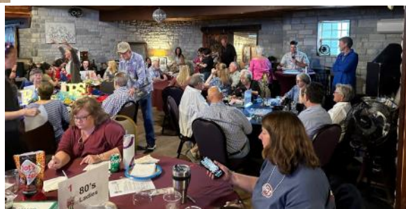
Attended Trivia Night presented by the Raytown Educational Foundation and held at Saddle Creek Stables & Vineyard.