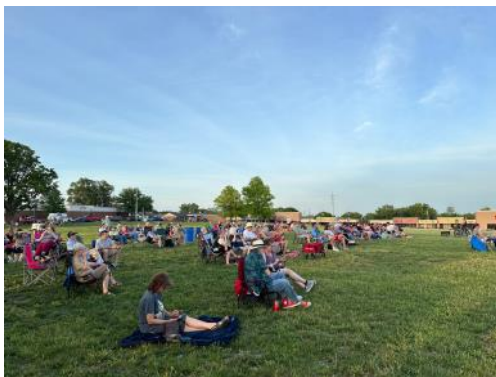
Raytown Live, 05/13/2023