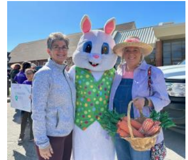
Several Raytown Chamber Board Members participated in the Raytown Main Street Association's annual Egg-Extravaganza on Saturday, April 8.