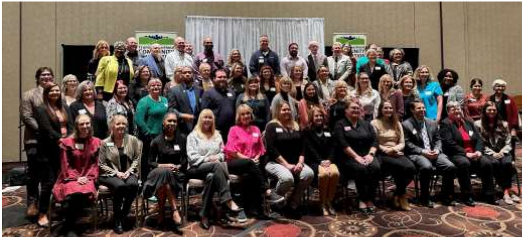
Grant recipients at the Truman Heartland Community Foundation grant luncheon in November. Congrats!