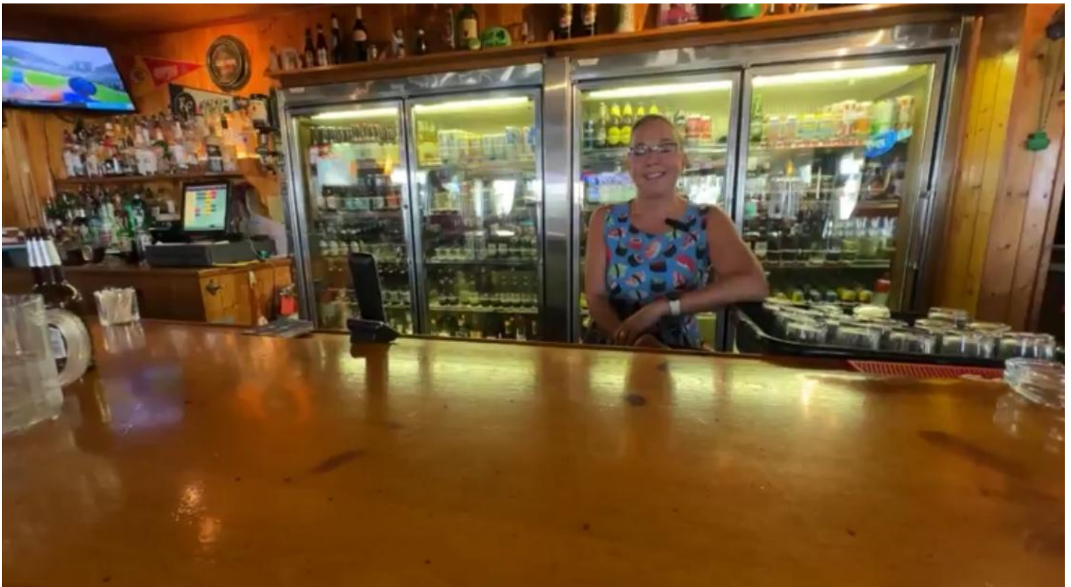
The Irish Pub House