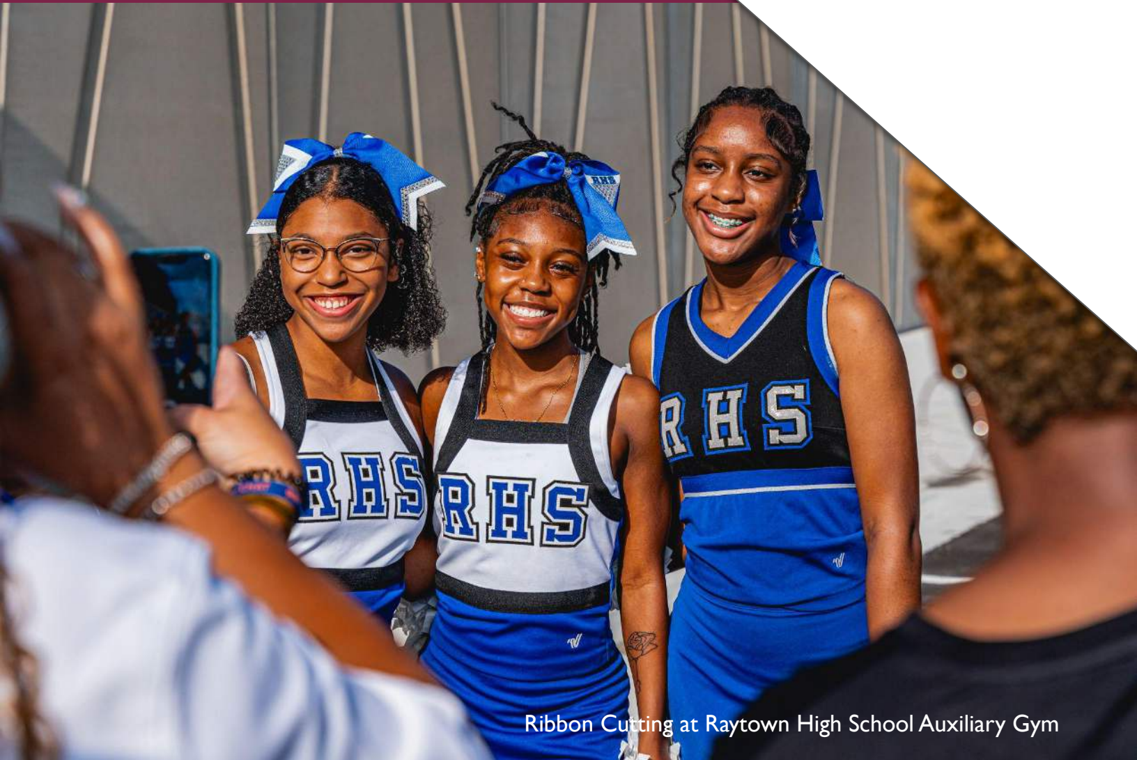
Ribbon Cutting at Raytown High School Auxiliary Gym