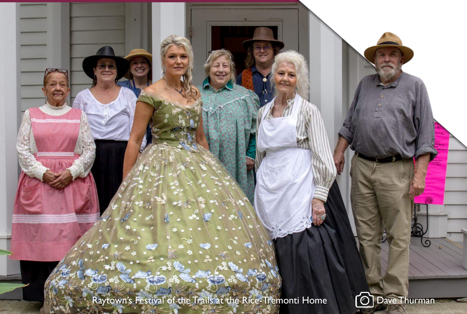
Raytown's Festival of the Trails at the Rice-Tremonti Home