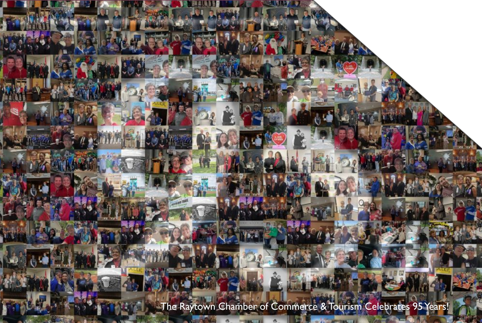
The Raytown Chamber of Commerce & Tourism Celebrates 95 Years!