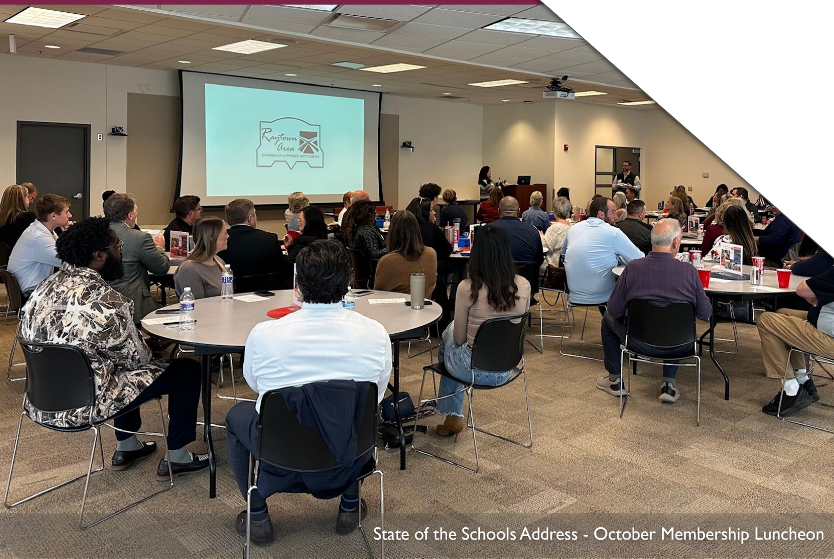
State of the Schools Address - October Membership Luncheon